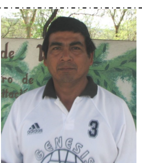
<u>Friday March 19th</u> Pastor Training Retreat