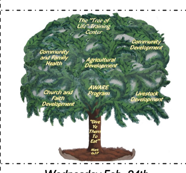
Wednesday Feb. 24th One group of Health Worker Graduates Community and Family Health Program