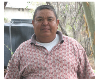
Saturday March 27th