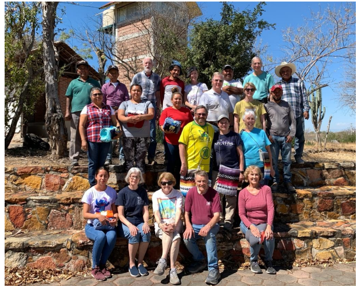
Tabernacle UMC, Fredericksburg, VA Team

To donate: Make your check payable to Advance GCFA and write GYTTE #07629A on the memo-line of the check.